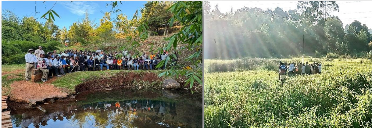
Photos above: 5 th Year's at Ondiri Wetland, hosted by the Friends of Ondiri Wetland Kenya team.