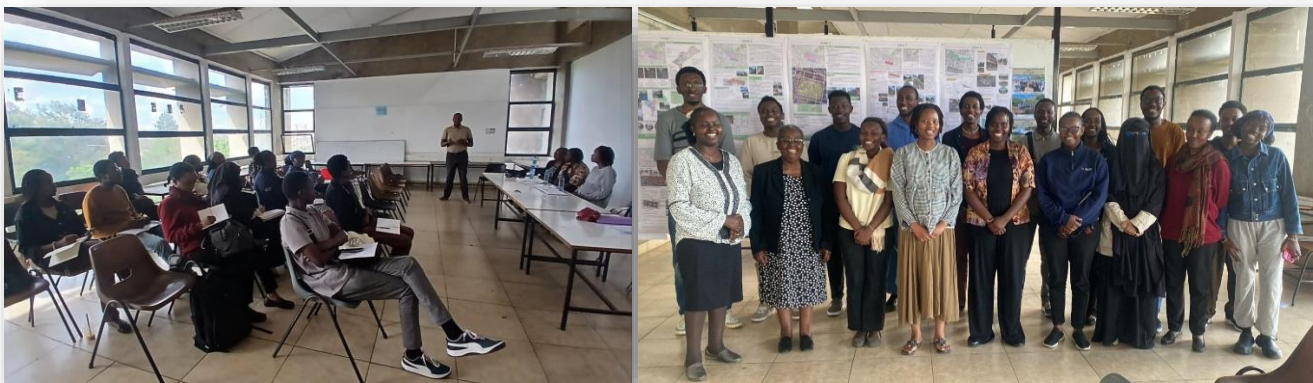
Photos taken on 31 st March 2026 during the Munyu curators’ visit to see the 5 th Year’s selected African Urban Forum Posters.